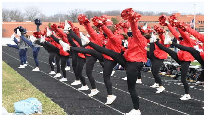
Cheer and Dance at our first "home" football game