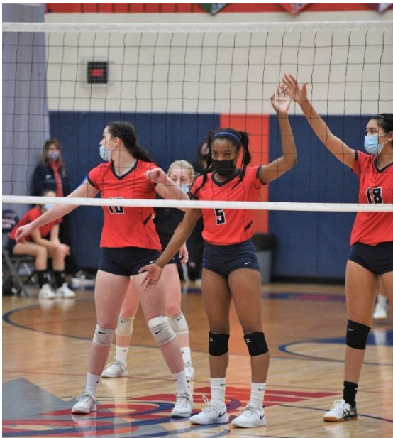
Varsity Girls Volleyball in action at home

It has been extremely busy in the athletic department with our spring and summer sports now in action. Our spring sports that are nearing the end of their seasons are Football, Boys Soccer, and Girls Volleyball and the summer sports that have just started practices are Baseball, Boys Lacrosse, Girls Lacrosse, Girls Soccer, Boys Tennis, Boys Track, Girls Track, and Boys Volleyball, with Wrestling beginin on April 19 th . Please make sure you are utilizing our website to check on schedules for all levels. We have also been very excited to begin to allow spectators the ability to come and watch games. Please be patient with us as we work through all of the rules and guidelines that we have to follow regarding spectators. Please remember that if you come on campus to watch a game you must always wear a mask and stay socially distanced from anyone that does not live in your household. We continue to strive to provide a safe and enjoyable experience for all of our student athletes during this time. Please remember if your student is sick keep them home and notify the coach. Please make sure you follow our athletic department and teams on Twitter and Instagram, the athletic department is @sehssports. As always, check out the athletic website for the latest information on the SEHS Athletic teams and as always ROLL STORM!